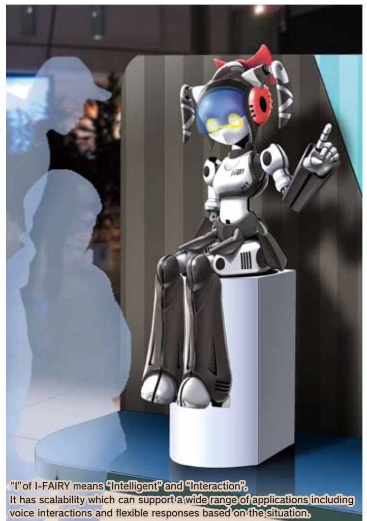
"I" of I-FAIRY means "Intelligent" and "Interaction". It has scalability which can support a wide range of applications including voice interactions and flexible responses based on the situation.