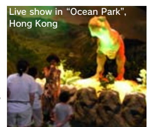
Live show in "Ocean Park", Hong Kong