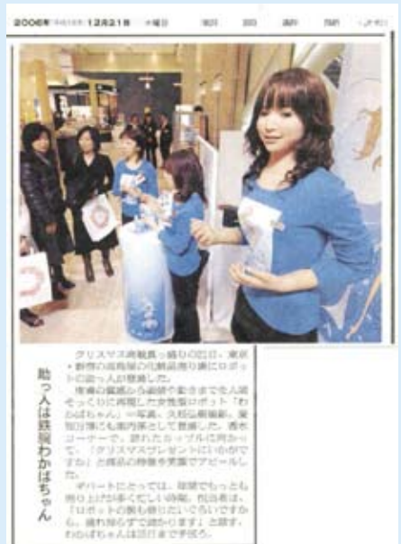
The article on the Actroid-DER2 was published in a newspaper (the Asahi Shimbun) on December 21, 2006.